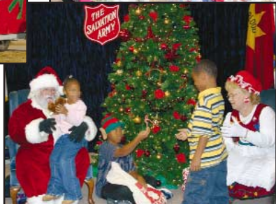
Children's faces purposely obscured for security reasons.