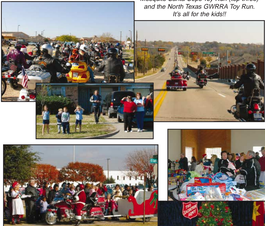
A few photos from the Mesquite Santa Cops Toy Run (top three) and the North Texas GWRRA Toy Run. It's all for the kids!!