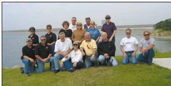
Photo-Op at Lake Texhoma Dam